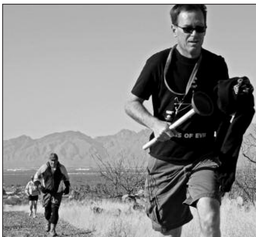
Hash runners, celebrating a tradition of sport and pleasure, make their way along a trail near Tombstone.