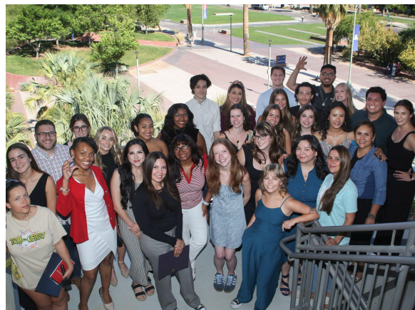
Scholarship and Academic Award winners at Just Desserts 2025